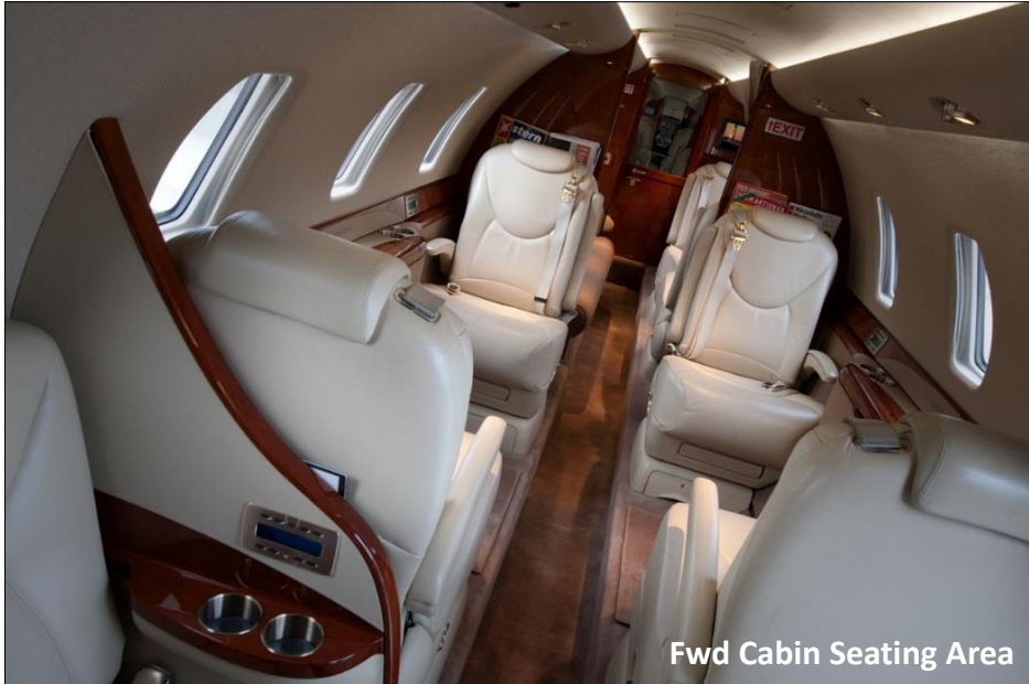
Fwd Cabin Seating Area

Main cabin seating: forward side-facing seat w/ armrest partition; mid-cabin 4 place club seating with custom tailored passenger seats with non-standard footrests and 2 stowable non-standard executive tables with metal inlays and leather tabletop inserts; mid-cabin partition with curtain.