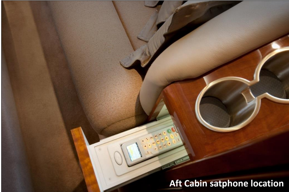
Aft Cabin satphone location

Cabin technology includes an Aircell Axxess II Satcom and AvVisor Plus (10.4") Cabin Display