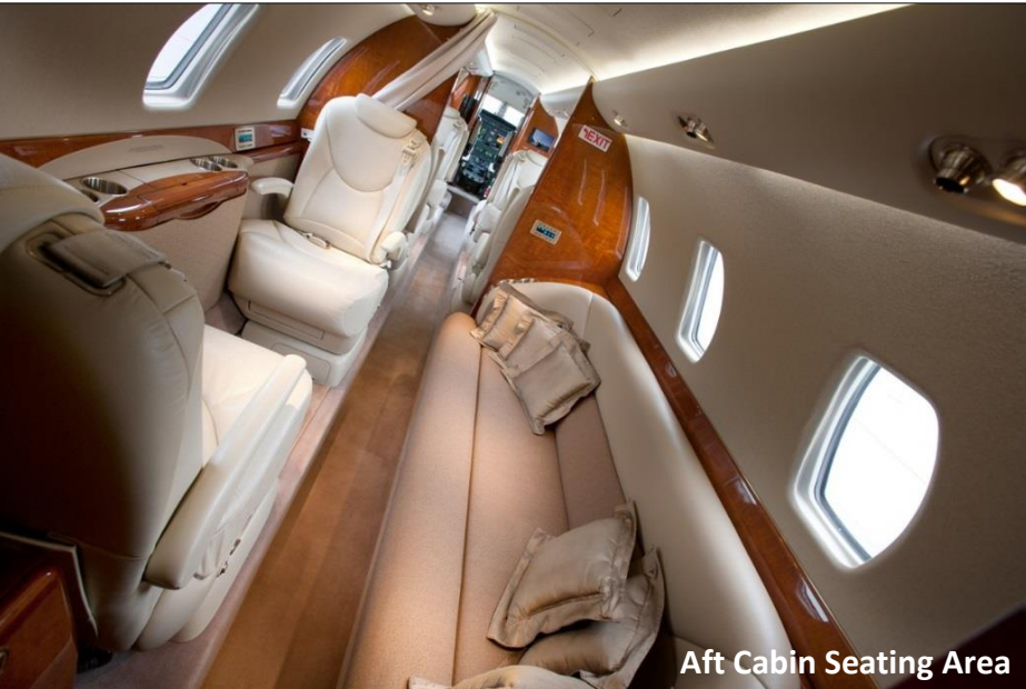
Aft Cabin Seating Area

RH after non-belted couch with dual cup holders in fwd & aft armrests opposite 2 club seats with footrests and a slimline stowable table with metal inlay on table bullnose with leather table top insert.