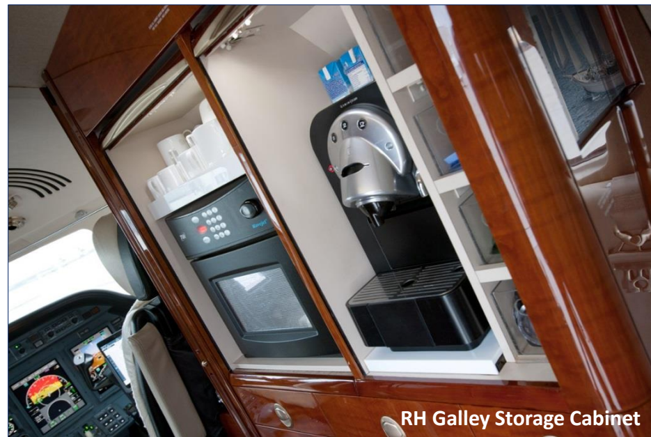
RH Galley Storage Cabinet

LH Forward galley with an XLS style refreshments center and a RH large XLS style cabinet with Microwave and tray carrier storage.